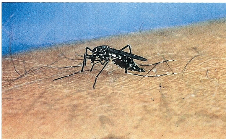
Aedes S.P. - Mosquito on human skin.