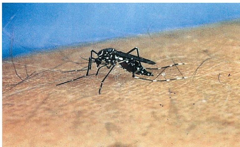
Aedes S.P. - Mosquito on human skin.

Factories Farms Food Handling Premises Houses Hospitals Hotels Military Barracks/ Camps Refuse Tips Restaurants Stables Warehouses