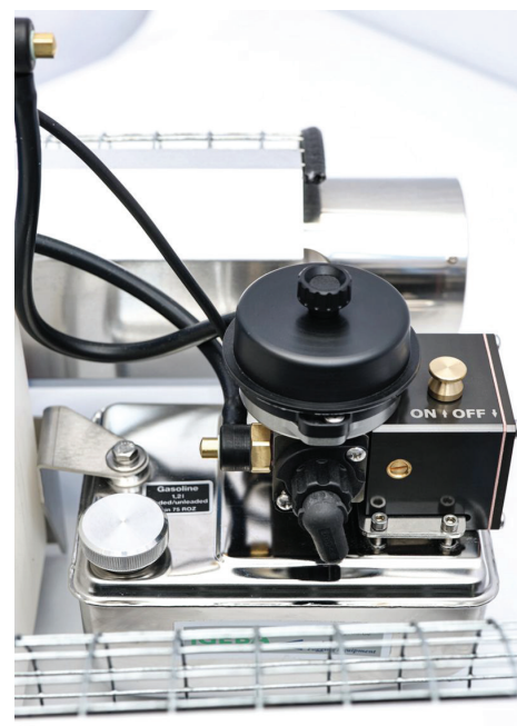
* Advanced Carburetor Technology (ACT)

The newly designed Advance Carburetor Technology (ACT) ensures unparalleled user-friendliness. Equipped with our unique ignition system without spark plug for the perfect start-up. It is easy to use, easy to maintain and safe. Through the years, its efficiency and reliability has remained unmatched in the industry.