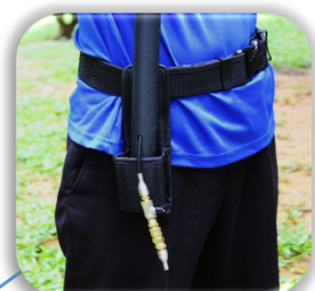
Heavy-Duty Waist Pouch