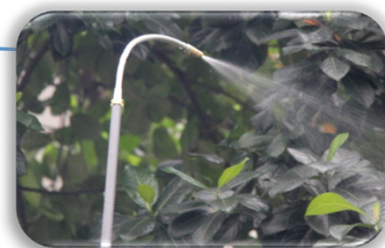
Flexible wand with cone nozzle